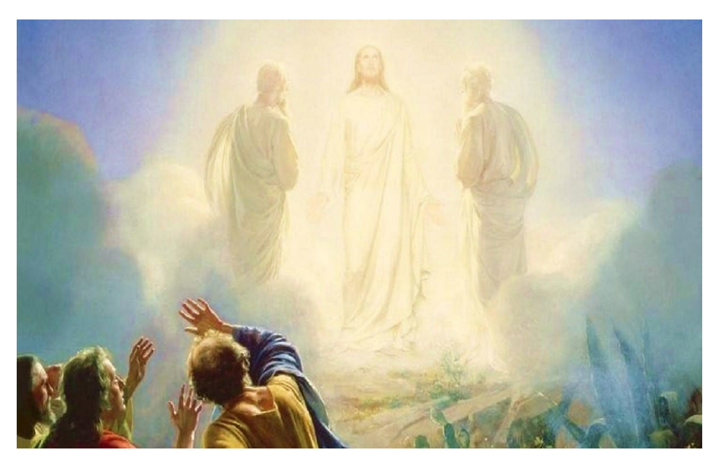
Who is this Jesus?